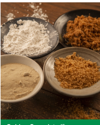
Golden Granulated® Raw Cane Sugars